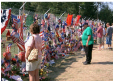
Brook Park Memorial Wall The 3/25 Comes Home

Tonight I attended the homecoming from the 3/25. I volunteered to help raise the American Flag between the two hook and ladder fire trucks and to hear the crowd cheer when the flag was being raised was so incredible.